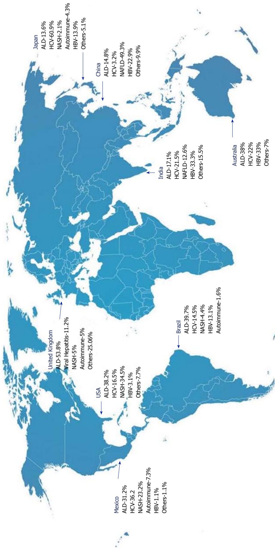
Figure 2 Changes in the epidemiology of liver cirrhosis in different countries reflect differences in etiologies, such as alcohol abuse and hepatitis B virus and hepatitis C virus infection. However, non-alcoholic fatty liver disease and its progressive form nonalcoholic steatohepatitis are becoming the most frequent etiologies of liver cirrhosis in Western countries. ALD: Alcoholic liver disease; HCV: Hepatitis C virus; HBV: Hepatitis B virus; NASH: Nonalcoholic steatohepatitis; NAFLD: Non-alcoholic fatty liver disease.

and obesity are the main underlying causes of liver cirrhosis in Europe and the United States. Alcohol is the strongest risk factor for chronic liver disease; alongside with NAFLD they represent 66% of liver diseases in the European population. The prevalence of NAFLD in this population is about 13%-44% which cause by itself the 13% of liver diseases and HCV with a prevalence of 0.13%-3.26% is related with 6% of liver disease. There is no percentage mentioned in European statistics about HBV (prevalence of 0.5%-0.7%) as cause of liver disease [8] . NAFLD affects around 51.7% of Americans followed by ALD (20.7%), HCV (8.6%), and HBV (3.1%) [6,42] . It is interesting to