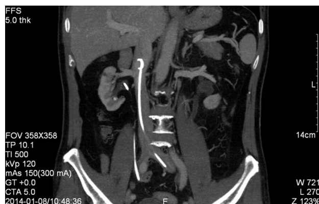
Figure 2 Computed tomography reconstruction of the abdomen confirmed the left ureteral stent in the inferior vena cava.

was uneventful. The diagnosis of stent displacement can be established by postoperative plain abdominal radiography and CT imaging.