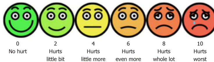
Figure 1 Wong-Baker FACES pain rating scale.