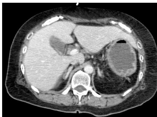
Figure 1 Computed tomography of the abdomen in Patient 2. Computed tomography of the abdomen revealed the absence of a spleen.

RPSA and expression of key spleen patterning genes [18] . The RPSA gene is inherited in an autosomal dominant pattern. However, since some of the mutations have incomplete penetrance [19] , we were unable to determine whether the children of Patient 1 had not inherited the faulty gene, or had inherited the gene, but were unaffected due to incomplete penetrance. We assume the difference of splenic expression between Patients 1 and 2 was due to variable penetrance.