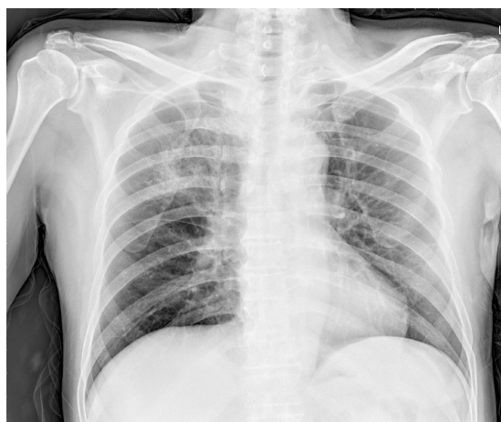
Figure 1 Chest radiography. Consolidation is seen in the right upper lobe of the lung.

COVID-19 in the upper respiratory tract specimen (nasal and throat swab) but positive for COVID-19 in the lower respiratory tract specimen (sputum). Combinations of hydroxychloroquine, lopinavir/ritonavir, and darunavir/cobicistat were added to treat the COVID-19 infection.