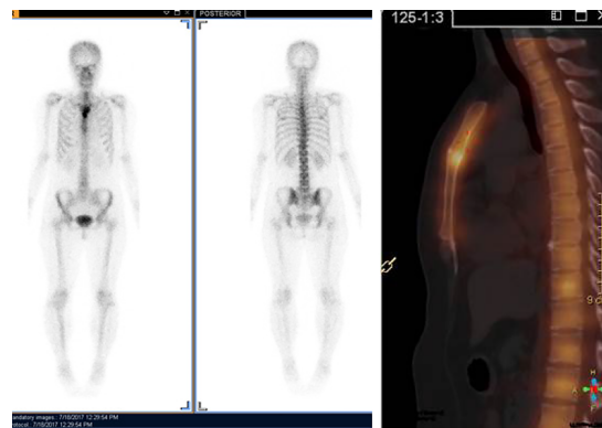
Figure 2 Bone scintigraphy scan with Tc 99m -MDP. Apparent fixation of the radiopharmaceuticals in the manubrium sternum and upper segment of the body of the sternum. No involvement of other sites of the skeleton was found.

pain for 1 mo, in view of the patients' age, symptoms, physical signs and imaging examination results, a mediastinal mass was considered as the primary diagnosis. For further diagnosis and treatment and to prevent misdiagnosis, the patient underwent a tissue biopsy and was finally diagnosed with sternal HL (MC) based on the pathological results. Following 6 cycles of chemotherapy, the patient achieved complete remission. Although CT, magnetic resonance imaging and positron emission tomography can be used for the diagnosis of chest wall or sternal tumors, careful clinical and comprehensive diagnostic workup is still needed in the treatment of such cases, which can improve the diagnosis rate, and avoid ultimate death due to misdiagnosis.