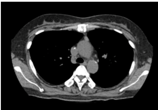
Figure 5 Chest computed tomography shows that the mass around the upper sternum was reduced obviously.