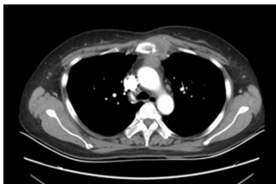
Figure 1 Chest contrast enhanced computed tomography scan. Patchy low-density shadows were seen in the upper sternum, and soft tissue mass formation was observed around the upper sternum, with a size of 3.9 cm × 2.8 cm and slight enhancement.

On immunohistochemistry (Figure 4): CD30 (+), Pax-5 (+), Ki67 (60%+), CD20 (-), and CD5 (-) were revealed, indicating a pattern typical of classical Hodgkin's lymphoma (mixed cellularity, MC).