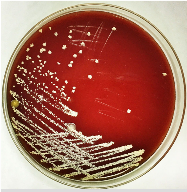
Figure 3 Culture of Nocardia cyriacigeorgica . Colonies of Nocardia cyriacigeorgica grew on blood agar plates.

choice for treatment. Critically ill patients often require combination therapy. The drugs that can be combined include aminoglycosides, carbapenems, quinolones, etc. , and the course of treatment usually lasts more than 6 mo. Patients with central nervous system involvement may need a longer course of treatment [1] . The clinical symptoms in our patient were relatively mild and improved after treatment with TMP-SMX combined with amikacin. Pulmonary sequestration itself was considered to have surgical indications after thoracic surgery consultation. However, the patient was recommended to choose the timing of surgery after adequate anti-infective treatment due to the presence of N. cyriacigeorgica infection.