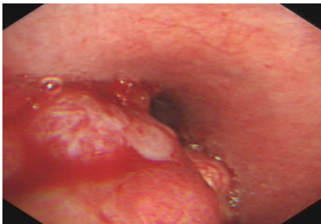
Figure 2 Bronchoscopic view of basal segment of the lower left lobe. A yellow-white mass obstructed the entrance to the basal segment of the lower left lobe. Lateral to the entrance of the basal segment of the lower left lobe, neoplasms with multiple nodular ridges and superficial hyperemia were observed.