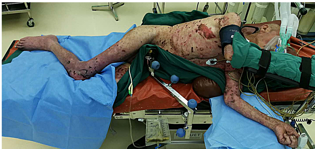
Figure 1 Image of the patient during treatment.