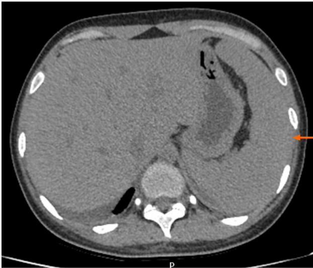
Figure 1 Abdominal computed tomography showed hepatosplenomegaly (orange arrow).