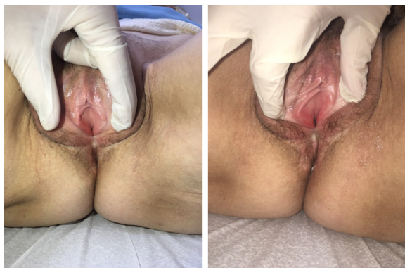
Figure 1 Pelvic inspection before and after 5 sessions of treatment (case 1).