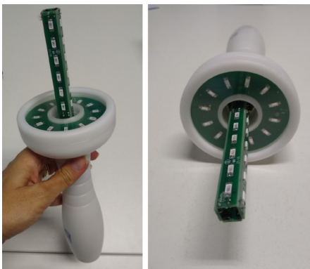
Figure 2 Blue LED device, Energy model (DGM Eletronica®, Brazil).

Likert Scale of Satisfaction (0-5). VIH: Vaginal Index of Health (5-25); MCI: Maturation Cell Index (0-100, considering 0-49 severe atrophy, 50-64 discrete atrophy, > 65 normal); VAS: Visual analogue scale (0-10); FSFI: Female Sexual Function Index (2-36).