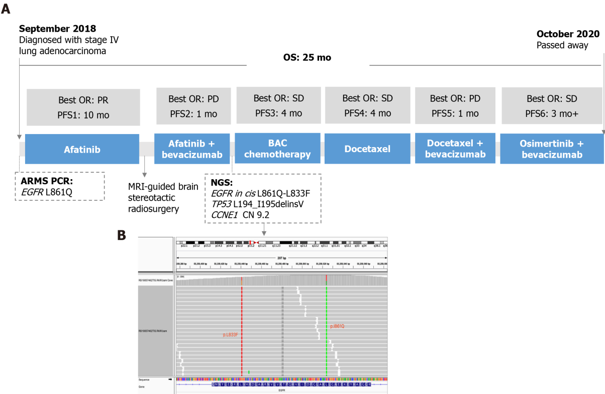
Figure 2 Treatment history and timeline of the patient's best objective response. A: Treatment history and timeline; B: Illustration of epidermal growth factor receptor L833F mutation in cis with L861Q mutation. BAC: Bevacizumab + pemetrexed + carboplatin; ARMS PCR: Amplification refractory mutation system polymerase chain reaction; NGS: Next generation sequencing; PFS: Progression-free survival; OS: Overall survival; EGFR: Epidermal growth factor receptor; SD: Stable disease; PD: Progressive disease.

deduced that this compound mutation actually presented at baseline before afatinib treatment, which ARMS-PCR failed to detect. The results support the advantage of NGS over PCR-based methods for detecting more complex mutations. PCR can only detect known mutations and those for which the PCR primers are designed, while NGS is able to simultaneously identify multiple mutations including unknown ones