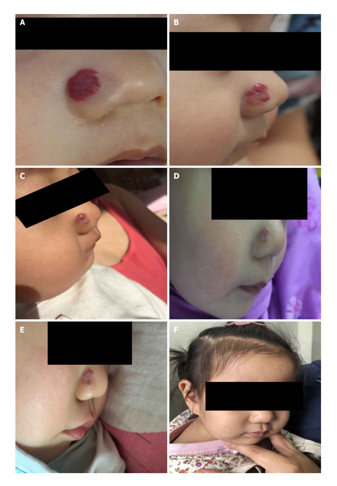
Figure 1 The manifestations of infantile hemangioma affecting right ala nasi in case 2 on first visit, day 30, 60, 80, 90, and 1 year after itraconazole treatment. A: First visit; B: 30 d; C: 60 d; D: 80 d; E: 90 d; F: 1 year.