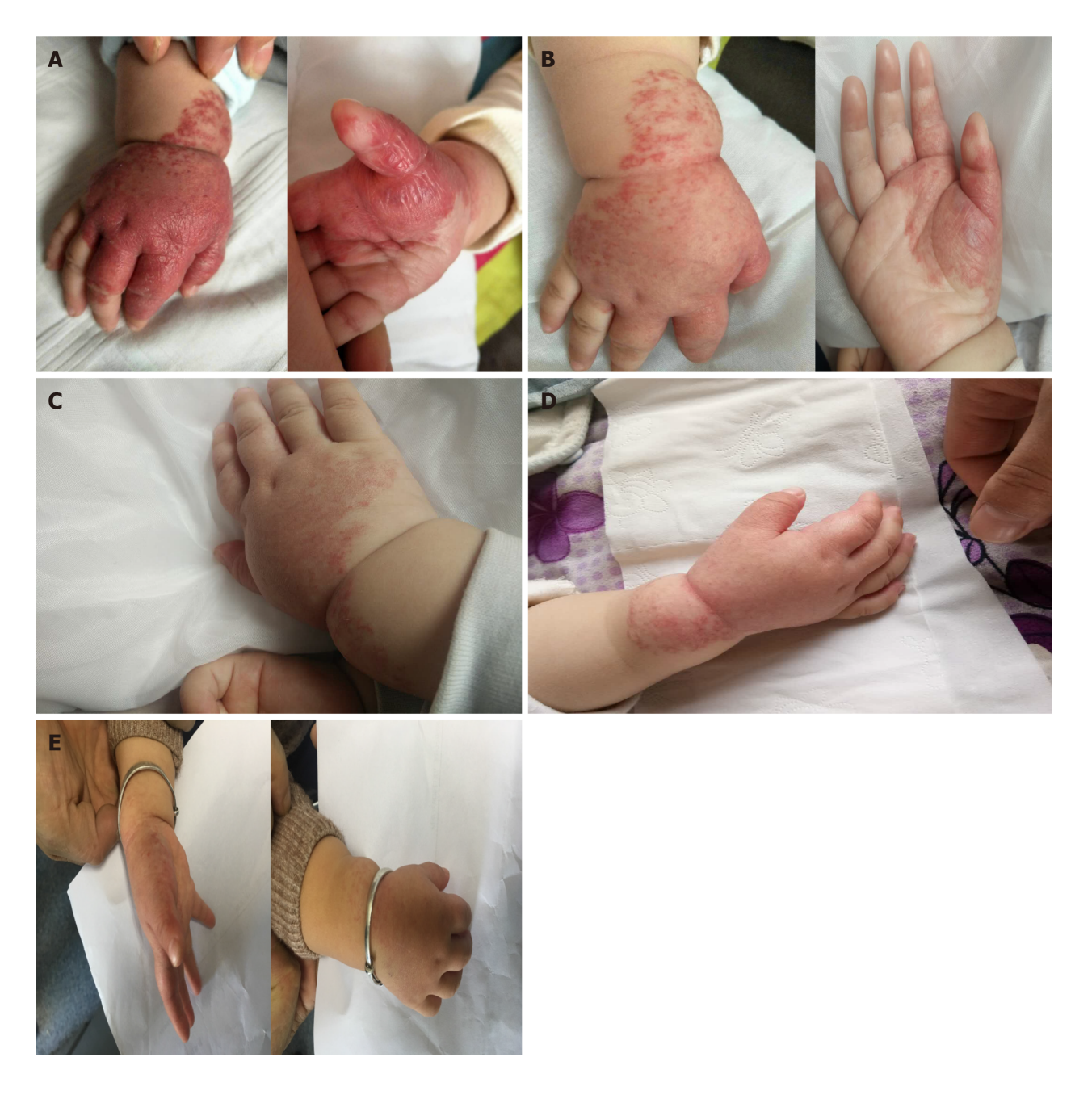
Figure 2 The manifestations of infantile hemangiomas affecting the right hand in case 1 on first visit, day 43, 80, 124, and 1 year after itraconazole treatment. A: First visit; B: 43 d; C: 80 d; D: 124 d; E: 1 year.