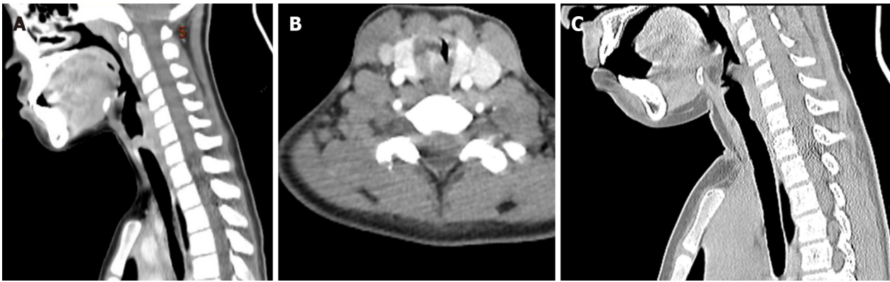
Figure 1 Preoperative and postoperative imaging. A: Computed tomography (CT) revealed a mass occluding about 90% of the tracheal lumen; B: Contrast-enhanced CT a soft tissue mass with obvious enhancement on the right posterolateral wall of the trachea; C: CT indicated a slight protrusion at the position of the incision.