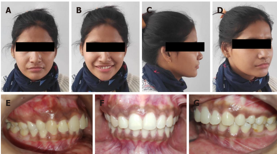
Figure 6 Three years post-retention pics (December 2020). A: Extra-oral frontal view; B: Extra-oral frontal with smile view; C: Extra-oral right profile view; D: Extra-oral right three-quarter view; E: Intra-oral right buccal view; F: Intra-oral front view; G: Intra-oral left buccal view.

monitor the stability of occlusion and any relapse of the lesion.