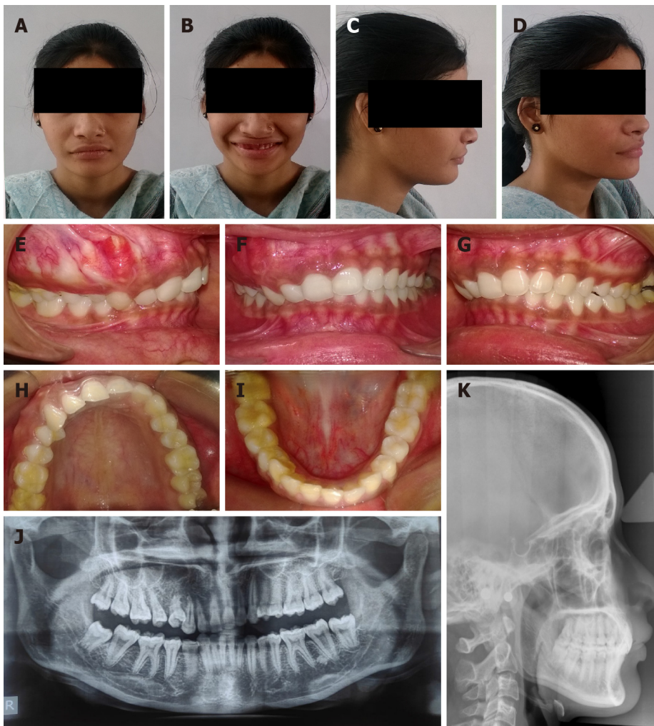
Figure 2 Post-surgical/pre-treatment photographs (October 2013). A: Extra-oral frontal view; B: Extra-oral frontal with smile view; C: Extra-oral right profile view; D: Extra-oral right three-quarter view; E: Intra-oral right buccal view; F: Intra-oral front view; G: Intra-oral left buccal view; H: Intra-oral maxillary occlusal view; I: Intra-oral mandibular occlusal view; J: Orthopantomogram X-ray; K: Lateral cephalogram.