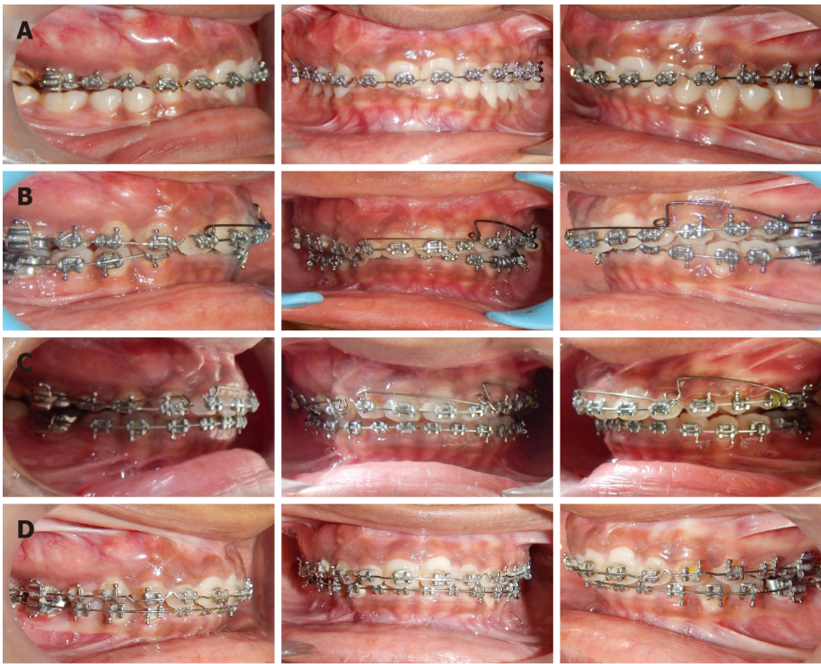
Figure 4 Treatment progress and orthodontic mechanics applied (timeline: Dec 2013-May 2017). A: Torquing wire with anterior differential palatal root torque; B: Lower arch bonding. Upper arch asymmetric anterior intrusion using unilateral Intrusion arch (.018" AJW); C: Separate canine intrusion arch (.018" AJW) and continued asymmetric anterior intrusion; D: Post-intrusion finishing and detailing.

orthodontic tooth movement in dysplastic bone, and the long-term prognosis of such treatment. A case report describing orthodontic repositioning of an impacted cuspid in fibro-dysplastic maxillary bone of a 12-year-old girl suggests a normal response of dysplastic bone to orthodontic forces[19]. Lee et al [3] and Akintoye et al [20] suggest delaying orthodontic therapy until after the age of skeletal maturity, based on the individual patient's needs and findings from an initial orthodontic evaluation. The advantage of such delay is that FD disease activity tends to decrease after skeletal maturity, which is reflected in a decline in bone turnover markers, a decrease in the number of mutated skeletal stem/progenitor cells, and a tendency of FD histology to improve over time[21]. Orthodontic treatment for the patient in the current report was initiated after completion of the pubertal growth spurt. Furthermore, four years post-surgery, there were no signs and/or symptoms of an active lesion. The OPG X-ray revealed less osseous density but predominantly regular woven bone in the area of the lesion, indicative of successful healing.