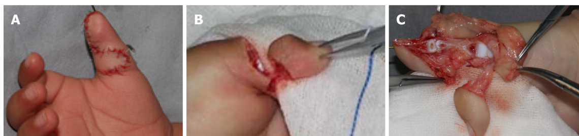
Figure 2 Surgical procedure of transfer flap. A: The excision of finger and flap was designed and transferred locally; B: The excision of nail flap was designed and transferred locally; C: The excision of composite tissue flap was designed and transferred locally.