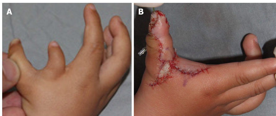
Figure 4 The design of the first web space. A: The narrow of the first web space and the thin and small finger were preserved before operation; B: The finger body was reconstructed by flap transfer and the first web space was enlarged.

When the two thumbs had different lengths (Figure 1B), we usually used the shorter thumb with pedicle extension and then combined it with the other thumb to keep the thumb length as long as possible (Figure 3B). The case presented in this study demonstrated that the pedicle can effectively extend to the distal end up to 1 cm, which is enough to compensate for the difference in length between the two thumbs. The skin defect of the proximal pedicle caused by the extension of the thumb to the distal end can be effectively covered by local skin.