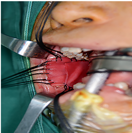
Figure 4 Acellular dermal matrix was sutured to the edges of the mucosa with 3-0 Vicryl after local excision.

remained stable. All patients' mouth openings returned to normal within 2-6 mo after surgery (Figure 6). During follow-up, no patients had recurrence of OLP after surgery. The longest follow-up was 11 yr, and the shortest was 6 mo. None of the patients relapsed during follow-up. Overall, surgical results were satisfactory in all cases during follow-up. For long-term results, we need more patients to be followed up over the long term.