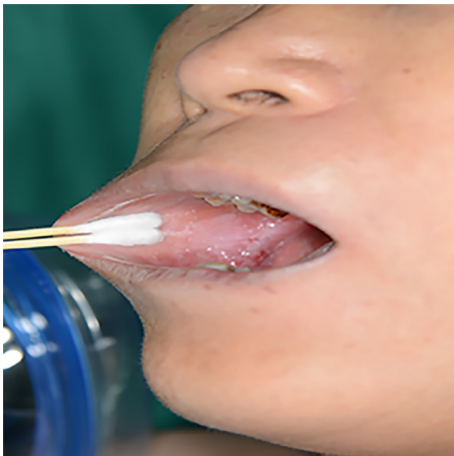
Figure 1 Clinical appearance. The lesion area of the right buccal lesion was about 4 cm × 3 cm, with white lesions within the area of erosion, congestion, and ulceration.

CT: Corticosteroid; F: Female; LP: Lichen planus; M: Male.