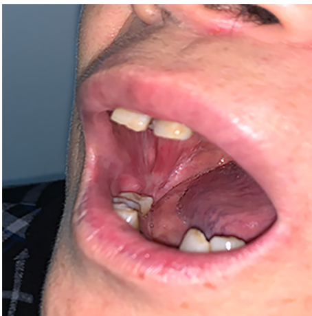
Figure 6 The surgical area was flat with similar mucosal tissue covering and local scar formation. The degree of mouth opening returned to normal. The transplanted area remained stable.