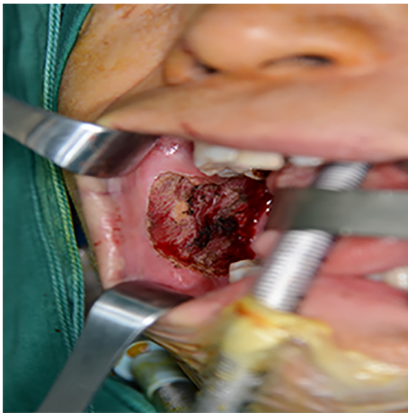
Figure 3 The entire layer of the mucosa lesions was removed, to a depth down to the muscular layer.

MMO: Maximum mouth opening; VAS: Visual analog scale.