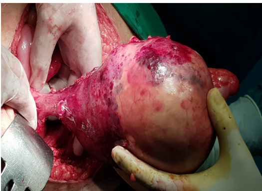
Figure 3 Intra-operative view of a large tumor implanted in the cecum.

asymptomatic, and in almost half of cases, they are diagnosed with acute appendicitis; therefore, preoperative imaging plays an important role not only in diagnosis but also in operative strategy [12] . Ultrasound, which is fairly sensitive, is best suited for suspected cases and, when complemented by CT, is largely used for the diagnosis, staging and follow-up of appendiceal tumors. However, magnetic resonance imaging (MRI) is more sensitive in identifying peritoneal disease [15] . Sometimes access to MRI is difficult in emergency cases, as it was in our patient, CT remaining the best available choice.