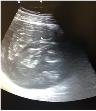
Figure 1 Ultrasound examination showing a voluminous septate cystic mass.