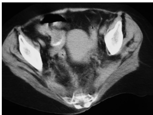
Figure 2 Abdominal CT scan revealed a markedly dilated sigmoid colon, extrasceral free air, and peritonitis.

Colon perforations may also occur in the early to late post-transplantation period [4,5,9,12] . Early-onset perforations are secondary to perioperative hypoperfusion, increased intraluminal pressure from narcotics, use of bowel stimulants, and high-dose immunosuppression while late perforations are often related to acute diverticulitis and invasive fungal or viral colonic disease [4,5,9,12] .