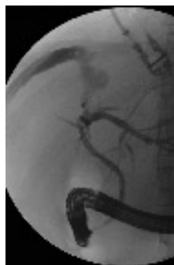
Figure 1 Endoscopic retrograde cholangiography shows biliary fistula at the anastomosis.

Separate databases were created for patients who