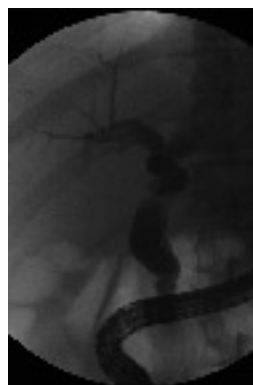
Figure 3 Endoscopic retrograde cholangiography shows lack of contrast flow through the papilla, and dilatation of the choledochus.

underwent OLTx and LRLTx. For each patient, the following data were recorded: demographic information and clinical data, type of biliary complication, time of onset, type of endoscopic treatment, number of procedures received, recovery-time, need for other treatment, surgery or re-OLTx, and final outcome.