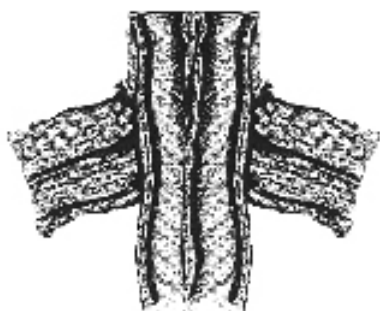
Figure 1 Afferent and efferent limbs brought out together.