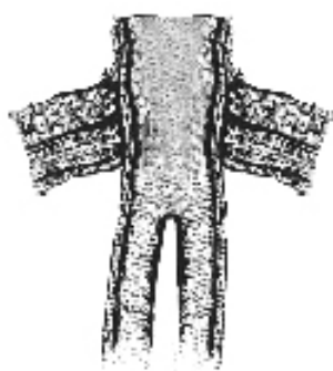
Figure 2 Side-to-side anastomosis performed, with the blind end forming a stoma.

Hospital of Larissa between 2000 and 2006. The patients' mean age at stoma formation was 66 years (range, 52-74 years). There were three female and two male patients, and all were Caucasian. Enterectomy was performed secondary to mesenteric vascular occlusive disease, radiation enteritis and small bowel injury. The clinical characteristics of patients are shown in Table 1.