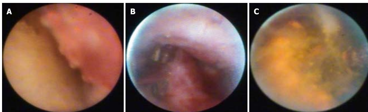
Figure 1 Spyglass® views of (A) bile duct adenoma, (B) cholangiocarcinoma, (C) bile duct stone with lithotripsy probe.