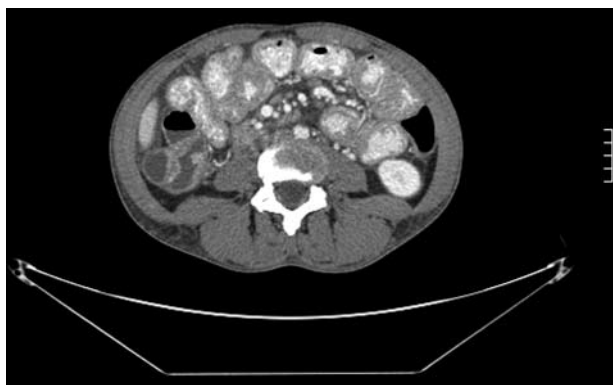
Figure 1 Computerized tomography scan image displaying diffuse lymphadenopathy and small bowel wall thickening.