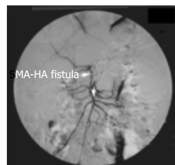
Figure 3 Selective superior mesenteric artery angiography showing a fistula between superior mesenteric artery and common hepatic artery.