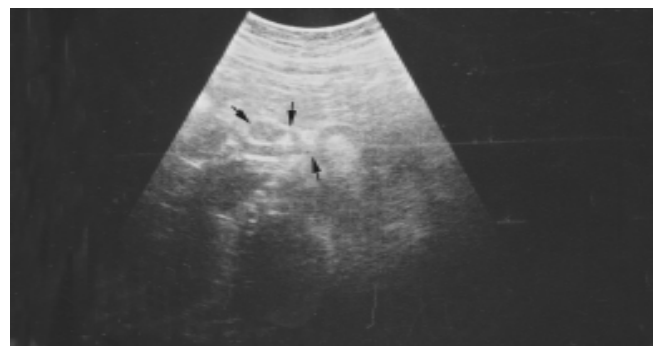
Figure 1 Sonogram showing a fistula (thin arrow) between superior mesenteric artery (arrowhead) and common hepatic artery (thick arrow).

tomography of the abdomen, plain abdominal radiography and upper endoscopy were normal. Abdominal ultrasonography showed a slightly enlarged liver with normal echo pattern and communication between the common hepatic artery and superior mesenteric artery (Figure 1). On Doppler ultrasound, arterial flow was observed within this fistula (Figure 2). We suspected CMI and consequently performed angiography. Celiac arteriogram revealed an abnormal fistula from the SMA to the CHA and not any other arterial communications (Figure 3).