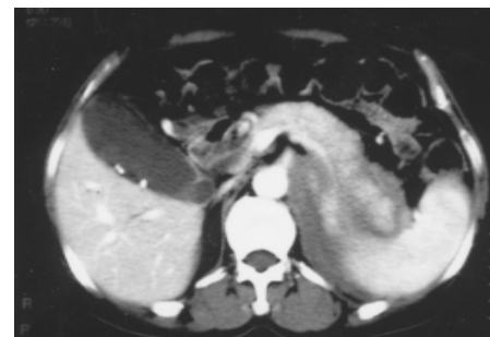
Figure 1 CT-scan demonstrated the change of retroperitoneal fibrosis around left kidney, atrophy of right kidney. The density of the whole pancreas was homogeneous.

A presumptive diagnosis of pancreatic cancer or cholangiocarcinoma was made and an explorative laparotomy was performed. We found that the retroperitoneum and pancreas