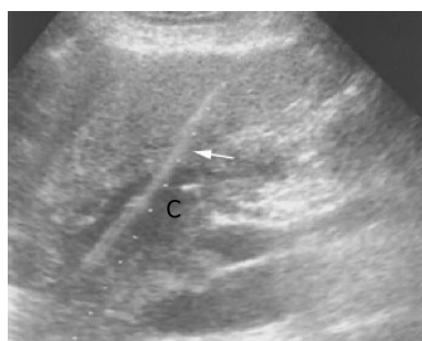
Figure 2 Under sono-guiding, drainage tube (arrow) put into adequate position for hepatic cyst (C).