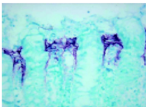
Figure 1 Colonic mucosa in CC (tenascin immunostaining, \times 400 ).

The diagnostic criteria were made on the histopathological features [13] . The histological features recorded were crypt architecture distortion, the severity and distribution of inflammation, surface degeneration, the presence and thickness of a sub-epithelial collagen band (immunohistochemical demonstration of tenascin expression), intraepithelial lymphocytes, any excess of eosinophils or neutrophils and the presence of apoptosis. (Figure 1).