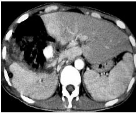
Figure 1 Axial contrast-enhanced CT scan revealing a vascular mass lesion in the right lobe of liver.