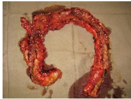
Figure 2 Photograph of the total colectomy specimen showing the classical features of Crohn's colitis: cobblestone mucosa with skipped lesions.