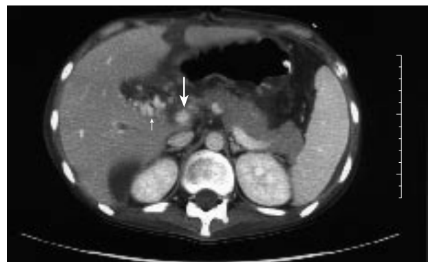
Figure 3 Computed tomography of the abdomen showing evidence of partial recanalization of the portal vein (long arrow) with increasing surrounding collaterals (short arrow).

Intraoperatively, generalized peritonitis with 2–3 L of faeculent fluid and pus was noted throughout the peritoneal cavity. The small and large bowels were densely matted together by inflammatory adhesions. The large bowel appeared shrunken and chronically diseased, but no perforated site was identified. No obvious stricture or perforation was noted along the small bowel. The adhesions between the bowels were removed, and this already resulted in a blood loss of 9 L because of severe coagulopathy. Damage control surgery with packing of all the raw areas was done and the patient was sent back to the ICU for