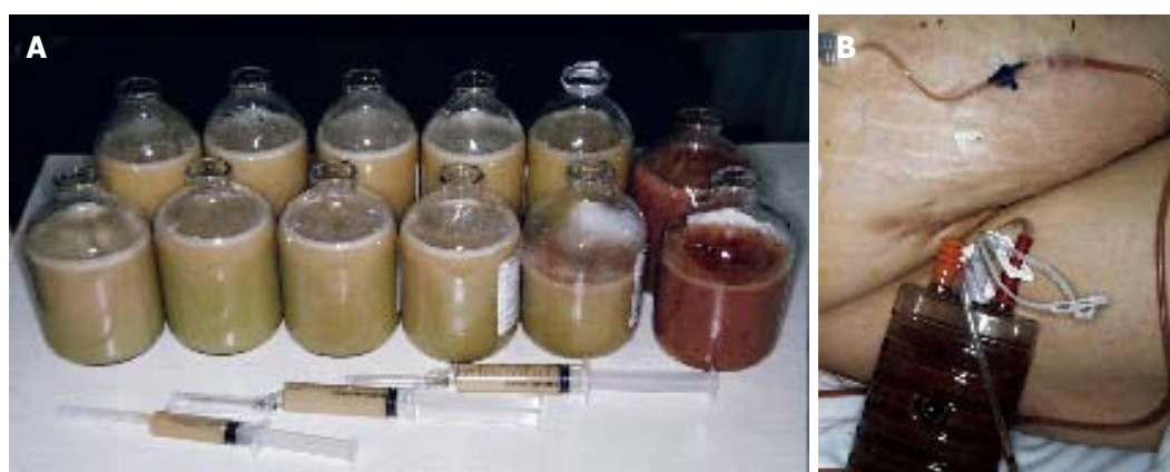
Figure 2 A: The aspirated fluid (6200 mL); B: drainage catheter with sucking bottle.

of the bile duct, or portal hypertension from portal vein obstruction. Following a presumably long latency, our patient presented with symptoms related to bowel obstruction caused by the space-occupying effect of the giant hydatid cyst. CT scans and ultrasonography are very useful for revealing well-defined cysts with thick or thin walls which correspond to our case as well [2] . The 6.2-L large cyst of our case is the largest hydatid cyst published in the literature. The visualization of daughter cysts within the larger cyst and the mural calcification helps to distinguish E. granulosus infection from carcinomas, bacterial or amebic liver abscesses, or hemangiomas [3] . Either spontaneously or as a result of a complication to surgery, free peritoneal rupture of the cyst can lead to fatal anaphylaxis. On the long term, leakage of the cyst may cause an intense antigenic response, resulting in eosinophilia, bronchial spasm, or anaphylactic shock.