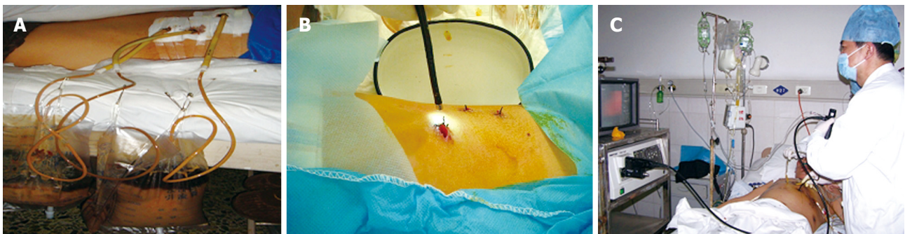
Figure 3 Debridement guided by choledochoscope. Formation of sinus tract around the drainage tube (A) with a choledochoscope slowly inserted into the focus through the sinus tract (B) 7 d after drainage with a large drainage tube, flushing of accumulated pus and necrotic tissue fragments from the foci of SAP by injecting a large amount of sterile saline and 0.5% metronidazole into the infected foci via the water inlet of choledochoscope (C).

incision was made through the skin and subcutis, and then the 8-Fr skin expander was inserted along with the guidewire to expand the sinus tract made initially by the drainage catheter. Second, the 8-Fr skin expander was pulled out, and 12-, 16-, 20-, and 24-Fr skin expanders with a diameter of 8 mm were inserted to gradually expand the sinus tract (Figure 2A). A sheath matching the 24-Fr skin expander was inserted and left in the focus (Figure 2B), and the expander was then removed. Finally, a 22-Fr drainage tube was inserted into the focus through the sheath lumen of the 24-Fr skin expander (Figure 2C and D).