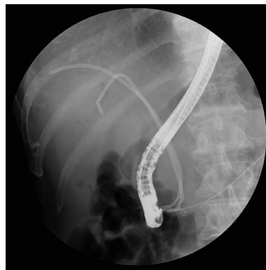
Figure 2 The second endoscopic retrograde cholangiography: the guidewire going through the side hole of the first plastic biliary stent worked as anchor-wire.