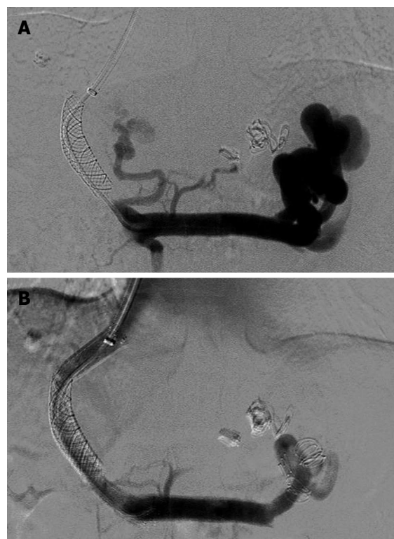
Figure 2 Portal venograms in a 45-year-old man with hepatitis B cirrhosis who had undergone transjugular intrahepatic portosystemic shunt for repeated variceal bleeding. A: The anteroposterior portal venogram obtained 5 mo after the initial transjugular intrahepatic portosystemic shunt procedure shows the complete occlusion of the stent and opacification of a massive spontaneous splenorenal shunt; B: Embolization of the splenorenal shunt was performed to maintain sufficient portal flow to keep the stent open. The portal venogram after Wallgraft stent placement reveals a wide patent shunt. The portosystemic pressure gradient decreased from 37 to 10 mmHg.

occurred (Figures 1 and 2). Four patients had transient discomfort in the upper abdominal area. A total of 15 patients developed new hepatic encephalopathy after the procedure, including nine patients with the Fluency stent and six with the Wallgraft stent. Eleven of these patients were successfully managed by protein restriction and lactulose administration. One patient was treated with shunt reduction by implantation of an additional Fluency stent, which raised the PPG from 7 to 10 mmHg. Hepatic encephalopathy failed to improve in the remaining three patients.