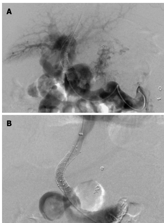
Figure 1 Portal venograms in a 52-year-old woman with hepatitis B cirrhosis who was treated with transjugular intrahepatic portosystemic shunt for recurrent variceal bleeding. A: Portography after crossing the previous shunt shows a patent splenic vein and the occluded main portal vein with cavernous transformation; B: After implantation with a Fluency stent, the portosystemic pressure gradient was reduced from 31 to 11 mmHg.