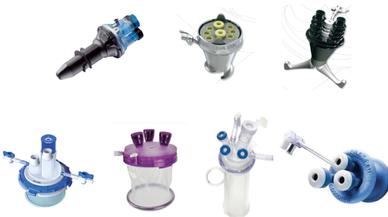
Figure 1 Commercially available single port devices: Reusable (upper) and disposable systems (lower).

deploy longer graspers to reach the target via the longer curved way. Handling with pre-bent instruments seems easier when starting with SIL. However, articulating instruments with rotating tips enable more degrees of freedom for complex movements in advanced procedures. The bent or articulating instrument should always be used in the supporting hand whereas the straight instrument is in the operating one to facilitate more demanding performance tasks, such as dissection, sealing, clipping or suturing.