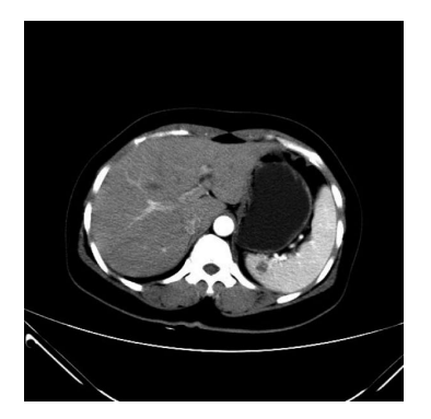
Figure 1 Enhancing computed tomography confirmed a hypo-dense ellipse occupying the upper pole of the spleen.

rare, benign, primary splenic tumors resulting from congenital malformations of the lymphatic system, which are mainly found in children, but occasionally in adults^{[2]} . Laparoscopic total splenectomy was traditionally recommended for the treatment of splenic neoplasms. However, with the better understanding of the importance of the splenic immune functions in both children and adults, changes have taken place regarding the surgical management and approach to splenic lesions. Laparoscopic partial splenectomy is minimally invasive and has become an elective procedure for preserving the splenic immune functions<sup>[3]</sup>. But the procedure is technically difficult. We herein report a rare case of a solitary splenic lymphangioma located at the upper pole of the spleen which was successfully managed by laparoscopic partial splenectomy using a Habib<sup>™</sup> 4X laparoscopic bipolar radiofrequency device.