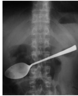
Figure 1 A plain radiograph of the abdomen revealing a tablespoon within the stomach.

In the present case, the tablespoon was a long metallic object, prone to slipping and difficult to grasp [6] . The polypectomy snare is considered useful for retrieving sharp objects [7,8] . Spoon removal from the stomach utilizing the double-snare technique has