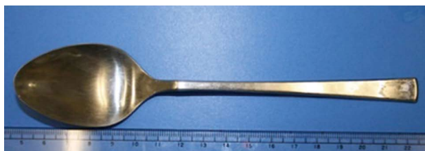
Figure 4 The retrieved spoon.

of the bowel mucosa as well as hemorrhage and perforation [9] . When a foreign body cannot be removed, surgery becomes the only option [10] . In this case, it was possible to extract the spoon from the duodenum using the manual abdominal compression technique on the body surface. However, manual compression may be dangerous if a sharp foreign body perforates the duodenal wall. Therefore, the usefulness of manual compression is dependent on the foreign body's sharpness and location.