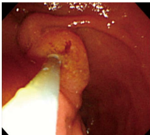
Figure 2 Endoscopic view of the papilla of Vater obtained by looking up from the anal side of the duodenal second portion.

placement of a plastic stent in the common bile duct was performed. In both cases there was no difficulty identifying the papilla of Vater or in cannulation of the bile duct using the conventional ERCP tube through the biopsy channel (Figure 2). No significant complications were encountered. In our case, we could cannulate the bile duct using the conventional tube at the inversed scope position, and perform biliary drainage for malignant obstruction with SEMS using the ultrathin endoscope. In addition, no complications were encountered including cardiopulmonary damage or post-procedural hyperamylasemia.