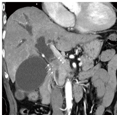
Figure 1 Contrast-enhanced computed tomography showed a 3-cm enhanced mass in the middle bile duct (white arrow) and dilatation of the intra-hepatic bile duct.

A 78-year-old female was referred to our hospital for jaundice and fever, and liver enzymes revealed an obstructive pattern with a serum level of total bilirubin 11.5 mg/dL (normal range: 0.33-1.28 mg/dL). She had been suffering from cancer of the pharynx for the past 6 years. She had undergone PEG for esophageal obstruction after radiation therapy for pharyngeal cancer. Abdominal contrast-enhanced computed tomography showed a 3-cm enhanced mass in the middle bile duct and dilatation of the intra-hepatic bile duct (Figure 1). We initially performed ERCP with a trans-oral approach using a side-viewing endoscope (JF-260V, 12.6 mm in diameter; Olympus, Tokyo, Japan). However, the scope could not pass through the esophageal orifice. Next, we used an ultrathin