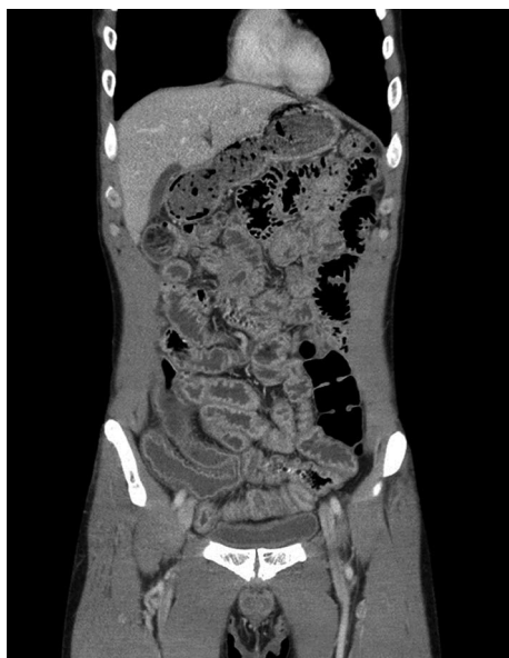
Figure 2 Abdominopelvic computerized tomography showing diffuse mucosal thickening and enhancement throughout the small bowel.