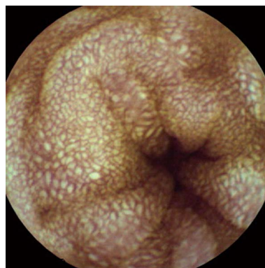
Figure 4 Capsule endoscopic finding. The image shows diffuse multifocal white mucosal plaques from the proximal jejunum to the terminal ileum, which is compatible with intestinal lymphangiectasia.

Intestinal lymphangiectasia (IL) is a rare disease, characterized by an abnormal lymphatic system of small intestinal wall and mesentery inducing leakage of lymphocytes and protein loss into the gastrointestinal tract. IL can be classified as primary and secondary IL by cause. PIL is a congenital abnormality of the lymphatic system. Some studies reported genetic factors associated with the hereditary lymphatic disease, and other studies reported regulatory signals involved in lymphangiogenesis.