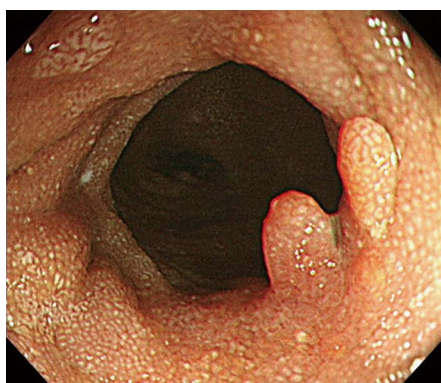
Figure 3 Colonoscopic finding. Image shows white mucosal plaques and spots in the terminal ileum.

immunological abnormalities. A low-fat/high protein diet was started to decrease lymphatic pressure and blockade. Medium chain triglycerides (MCTs) are directly absorbed into the blood stream; therefore, he was also prescribed an MCTs diet. After the dietary treatment diet, diarrhea was diminished by degrees and improved a week later.