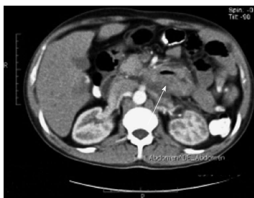
Figure 2 Abdominal computed tomography scan demonstrating a thickening of the wall involving the 3 rd and 4 th portions of duodenum, narrowing its lumen (arrows), without clear lines of cleavage with adjacent structures and with no evidence of nodal and distant metastasis.

the rate of potentially curative resections [7,15] . After nondiagnostic conventional endoscopic tests, in the setting of iron deficiency anemia, it is worth having a high index of suspicion for tumors beyond the second portion and to carry on the work-up using a method of greater accuracy for these tumors, the endoscopic capsule [8,16] .