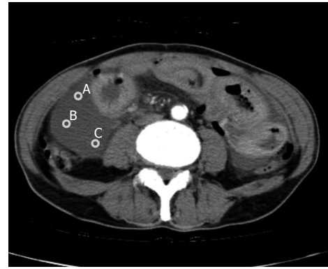
Figure 2 Representative measurements of computed tomography attenuation values by the 2D method. The CT attenuation values of three arbitrary points on the ascites (A, B and C in the CT slice) were measured, and the mean value was calculated. CT: Computed tomography.

by three-dimensional (3D)-CT volumetry (a volume rendering method) using OsiriX computational open source Digital Imaging and Communication in Medicine imaging software (v.3.7.1; OsiriX Foundation, Geneva, Switzerland) (Figure 1). The average CT attenuation values were calculated from the 3D constructions of where the greatest fluid accumulations were found. All the measured ascites fluid volumes were at least 5 cm 3 . All the measurements were performed in a similar manner, using a single CT slice image (2D