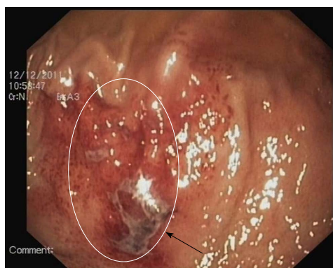
Figure 2 Gastric fundus mucosal congestion, erosion, active bleeding and an irregular hematin-based shallow ulcer within the thin white fur (arrow) in the 58-year-old man who underwent endoscopy due to coffee-ground vomitus and melena. Prior to the occurrence of the melena, the patient had ingested 8 bags of TouTongFen.

patients were asymptomatic and were instructed to avoid all NSAIDs and to use proton pump inhibitors (PPIs) if necessary to prevent ulcer recurrence and other complications. These two patients remained relatively healthy with the exception of occasional epigastralgia that was improved upon the use of over-the-counter drugs. Two years and three months after the initial endoscopy in March 2015, the female patient exhibited a recurrence of persistent epigastric pain. She consequently underwent a second endoscopic examination revealing that the bridge between the two channels had disappeared, resulting in a single large opening (Figure 3A) and a duodenal kissing ulcer (Figure 3B). A urea breath test indicated persistent H. pylori infection. This patient also admitted to the continued use of TouTongFen to treat gouty arthritis attacks. Because the ulcer remained, this patient was treated with triplex H. pylori eradication therapy and PPI maintenance therapy. The patient's abdominal pain rapidly improved, and she was healthy at the last follow-up.