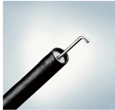
Figure 1 The Olympus HookKnife [2] -A rotating L-shaped cutting wire designed to hook mucosal tissue and pull it towards the lumen. It was originally designed for use in colonic polypectomies. In Oyama et al [3] the HookKnife was deployed to resect lymph node metastases of gastric and oesophageal mucosal cancers.

In each case the external PEG tubing was cut short to around 5 cm from the abdominal wall. A 15 mm through-the-scope dilation balloon was passed externally via the PEG tubing and inflated to dilate the mucosal orifice. A mucosal orifice was visible in all the patients in this case series. If a mucosal orifice cannot be clearly visualised then it may be found using the balloon catheter tip inserted externally. If there is no