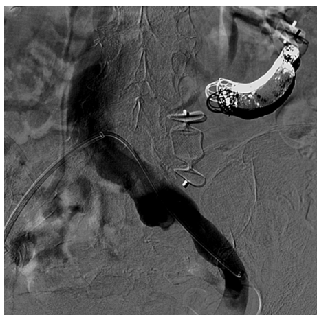
Figure 3 Completion angiography. Shunt exclusion after endovascular embolization by detachable coils and two plugs and patency of the left internal iliac vein and inferior vena cava.

stable conditions after a two years follow up.