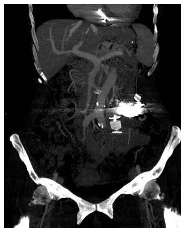
Figure 4 Follow up MIP (maximum intensity projection) computed tomography at 1 mo. Pointed out the patency of the superior mesenteric, splenic and portal veins. Coils cast and plugs, proximal and distal, completely excluded shunt's flow. Platinum coils-related artifacts are evident above the nitinol plug. The course of aorta parallel to superior mesenteric vein is depicted.

Hepatic encephalopathy is in most cases a direct consequence of cirrhosis, which generates portal-systemic venous shunts ultimately resulting in bypass of the liver. This latter aspect accounts for the fact that neurotoxic substances, such as ammonia, are not effectively detoxified by the liver and flow in high concentrations into the systemic circulation affecting the brain [1] . However, even if, by far less frequent, cases of hyperammonemia not associated with cirrhosis were previously described. Indeed, elevated concentrations of circulating ammonia in patients with normal liver function were reported in a wide spectra of conditions which include high protein diet, severe constipation, gastrointestinal bleeding, several drugs, gastric Helicobacter pylori infection and urinary