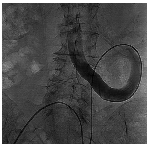
Figure 2 Direct venography from right femoral vein approach, by a 5 Fr diagnostic catheter, of the porto-systemic shunt. Confirming the presence of the retroperitoneal loop with a hepatofugal flow to the left internal iliac vein.