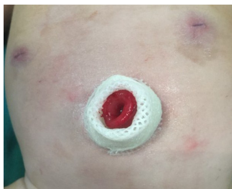
Figure 1 Appearance of transumbilical enterostomy.

270° anticlockwise, and the appendix was cut at the same time. The colon was pulled down directly in TCA. An Endo-Cutting (Johnson-Johnson Co., Ltd) Stapler was then used to facilitate extra-anal division of the rectum perpendicular to the anus, to obtain a short 3.5-4.5 cm rectal stump. Single-layer 4-0 Vicryl was used to complete the colorectal or ileorectal end-to-side anastomosis and the Endo-Cutting Stapler was used to complete the colorectal or ileorectal side-to-side anastomosis.