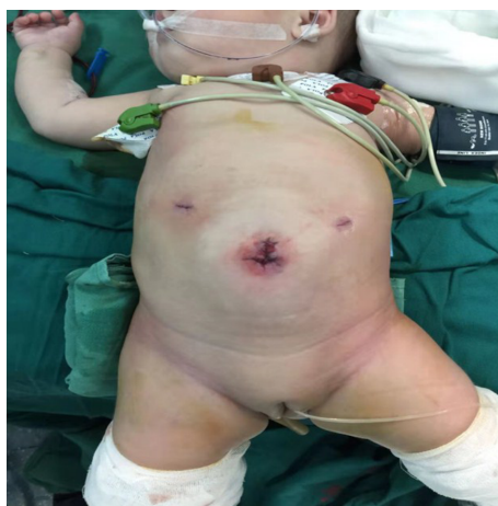
Figure 2 Appearance of the umbilicus after the two-stage laparoscopy-assisted pull-through with stoma closure.

group and 5 patients in the CAE group (12.50% vs 17.24%, P > 0.05 ), and treatment consisted of intravenous fluid, antibiotics, parenteral nutrition, and enemas. In the TUE group, umbilical ring narrowing, obstructive symptoms, and fecal impaction were not observed; thus, the outcome after diverting the fecal stream was satisfactory. In the CAE group, we noted obstruction after enterostomy in 1 case. One child developed adhesive intestinal obstruction on postoperative day 16, but responded well to conservative management (Table 2).