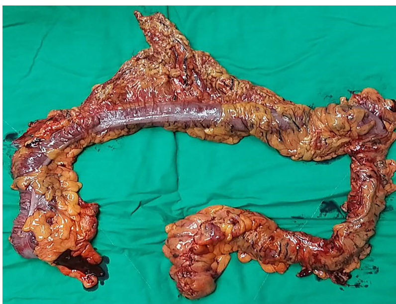
Figure 2 Specimen after laparoscopic-assisted subtotal colectomy.

colectomy in STC patients. We observed no AL in our 32 STC patients who underwent an SRA-sparing operation. Although our study had a small sample size, the preservation of the SRA seems to have an excellent surgical outcome.