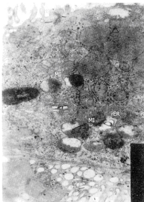
Figure 1 The mitochondria were enlarged in the chief cells in chronic gastritis patients differentiated into the PXG category.