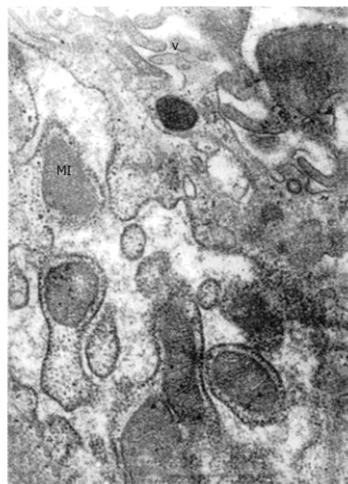
Figure 2 The rER in chief cells enlarged and some showed intracisternal sequestration in chronic gastritis patients differentiated into the GBG category.

decoction (SHD, dispersing the stagnated Liver Qi and regulating the stomach). This decoction contained 10 g of Chaihu ( Radix bupleuri ), 15 g of Baishao ( Radix paeoniae alba ), 10 g of Zhiqiao ( Fructus aurantii ), 5 g of Muxiang ( Radix Aucklandiae ), 10 g of Shenggancao ( Radix glycyrrhizae ), 10 g of Yujin ( Radix curcumae ), 15 g of Yanhusuo ( Rhizoma corydalis ), 10 g of Baizhi ( Radix angelicae dahuricae ), 10 g of Danggui ( Radix angelicae sinensis ), and 10 g of Jineijin ( Endothelium corneum galli ).