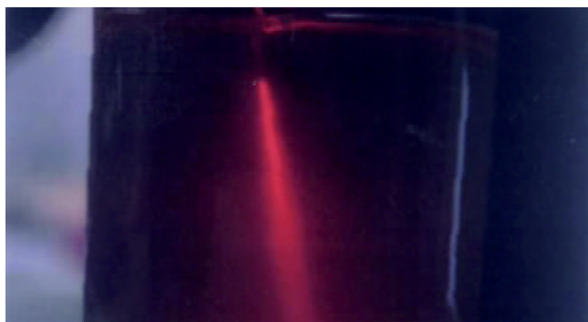
Figure 2 High density linear laser energy from fiber.