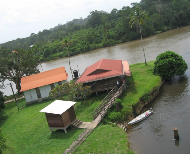
Figure 2 Healthcare centers of Trois-Sauts and Camopi.