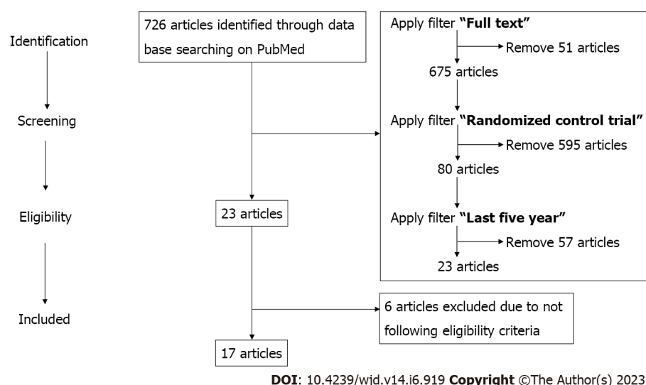
Figure 2 Flow chart of study selection process. Created from: https://prisma-statement.org/prismastatement/flowdiagram.aspx .