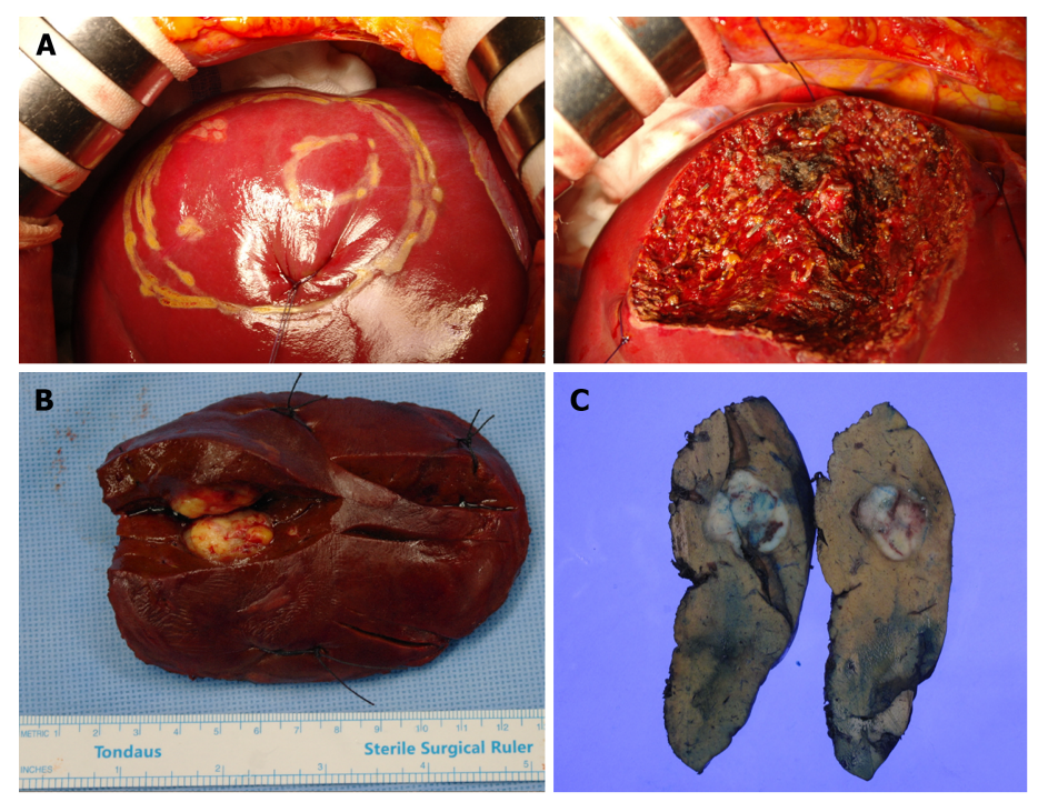
DOI: 10.4240/wjgs.v15.i5.992

Figure 5 Intraoperative finding, gross finding, and pathological specimen. A: Intraoperative finding. After demarcating the tumor location and resection margin using intraoperative ultrasonography, liver segmentectomy of segment 8 was performed; B and C: Gross finding of the resected liver (B) and pathological specimen (C). The resected specimen exhibits a 2.4 cm × 2.2 cm × 2.0 cm white-yellowish solitary mass that is firm and relatively well-demarcated.