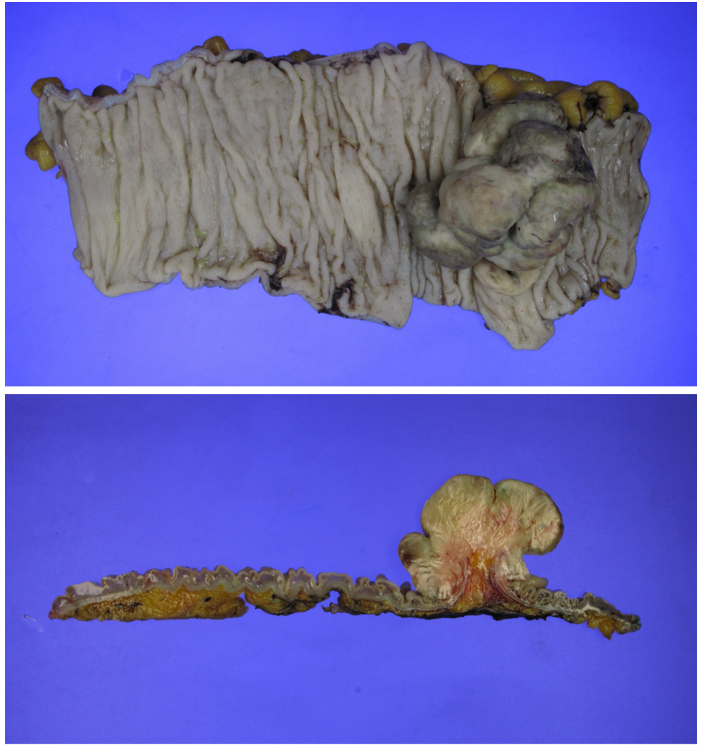
DOI: 10.4240/wjgs.v15.i5.992

Figure 3 Gross pathological specimen after the left hemicolectomy. A 7.5 cm-sized leiomyosarcoma originating from the descending colon was identified.