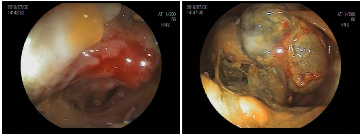
DOI: 10.4240/wjgs.v15.i5.992 Copyright ©The Author(s) 2023.

Figure 1 Endoscopic findings of large polypoidal mass in the descending colon.